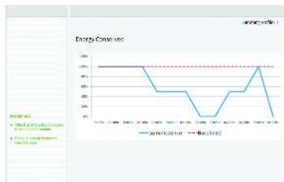
Sample report: Energy Conserved (daily report)